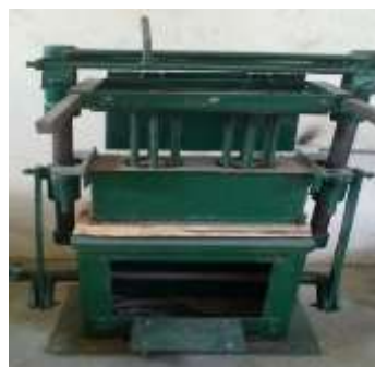
Plate 1: Modified vibratory briquette making machine

This motorized vibratory briquette making machine (Plate 1) has four major assembling units which comprises of the housing frame, the mould unit, the ram and the head casing.