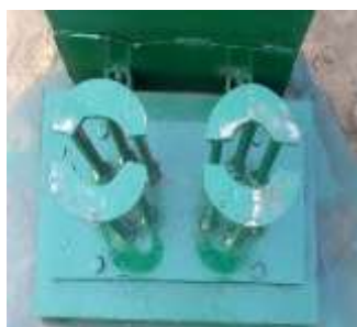
Plate 4: Ram plate

The Ram: In order to achieve proper briquette compaction, a ram is introduced as a press. The ram itself holds the piston press and it comprises of the ram guide shaft with a sliding groove slot on both sides for easy attachment to the head casing. A plate of 10 mm thick mild steel holding the two cylindrical shaped piston studs of six pieces of Y12 rod for each mould is fastened to the rammer guide by four 10 mm bolts (Plate 4).