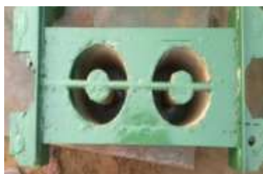
Plate 3: Machine mould unit

The mould unit itself is attached to the housing by four 10 mm studs on the mould compartment at the four corners by a corresponding landing groove on the housing frame vertical shaft.