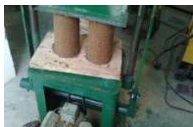
Plate 6: Ejection of briquettes from the machine

The briquettes were then analyzed for the following combustion properties; percentage volatile matter, ash content, percentage fixed carbon, heating value and the results are presented in Table 1: