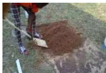
Plate 5: Material preparation

Sawdust of 50 kg was collected from saw mill, Mokwa road, Bida, Niger state Nigeria. They were manually cleaned using sieve of hole size 3 mm diameter which allowed passage of the saw dust and retain unwanted materials such as sand and lumps of mud. The saw dust were dried in the sun to reduce the moisture content to 5 % and mixed with measured quantities of cassava starch gel (water/starch solution) of five different concentrations: 10, 20, 30, 40 and 50% and mixed uniformly with a shovel (Plate 5). The resultant aggregate was fed into the briquette machine, compacted and discharged on the mould pallet (Plate 6) and the briquette produced was sun dried to a moisture content of 5% (Gbabo et al. , 2018).